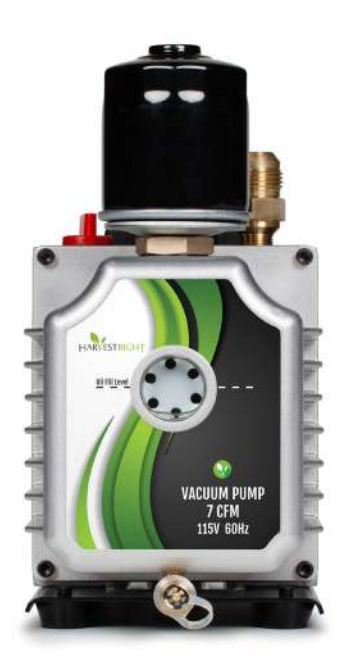
DIMENSIONS 10\frac{1}{2} " H x 16" D x 5<sup>3</sup>/<sub>4</sub>" W